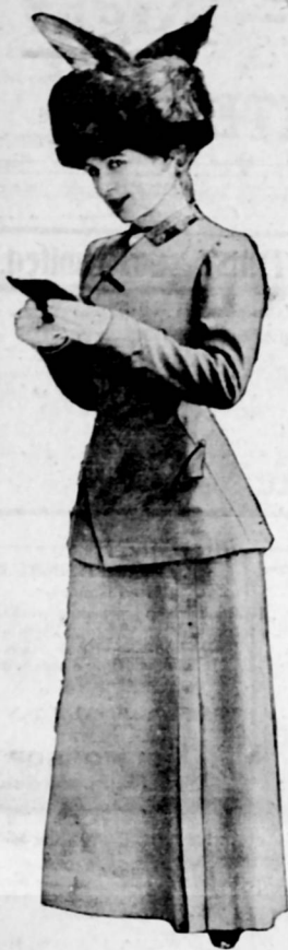
Cloth Street Costume With Velvet Collar

COMBINING different materials is one of the season's styles that has apparently met with most marked approval. There is much that is practical in the idea, for often the material most satisfactory for skirt and coat is quite impossible for the waist, and a thinner fabric for the waist would be impracticable in a skirt. Foulard and serge, cloth and satyn make effective combinations. Voile de soie and liberty satin is another popular combination, and the manufacturers have most kindly furnished the same shades in all leading colors, so that the task of selecting just the right shades is not so difficult as might be expected. Simple and dainty but smart and becoming is one of the models for a voile de soie and liberty satin gown. The upper