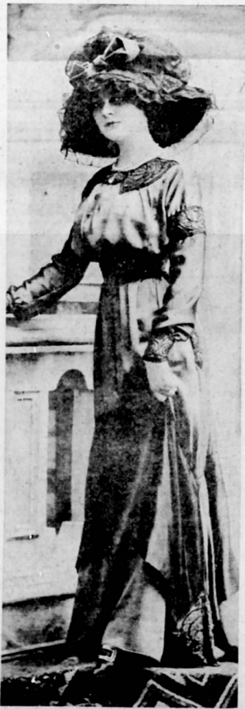
Cashmere de Soie and Liberty Satin Gown

With the lower cut corset and the lower waist some support to the bust is, as a rule, necessary to make the waist, unless perfectly boned or fitted, look well, but there are several new brassieres or bust supporters this year that are very